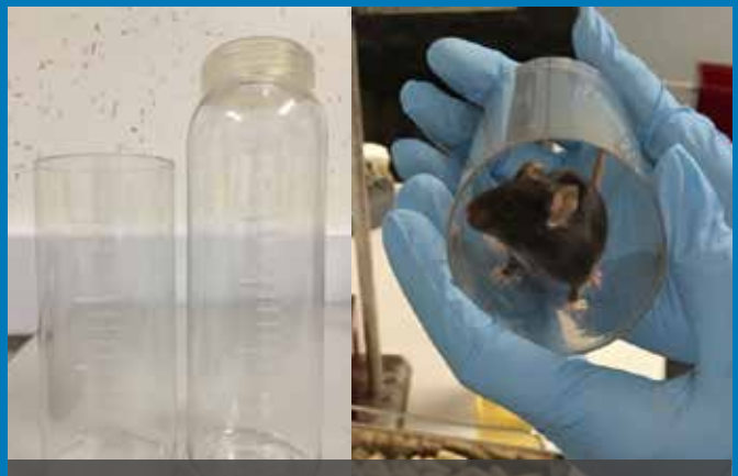
Old plastic water bottles can be recycled into mouse handling tunnels to cut down on costs and resources.