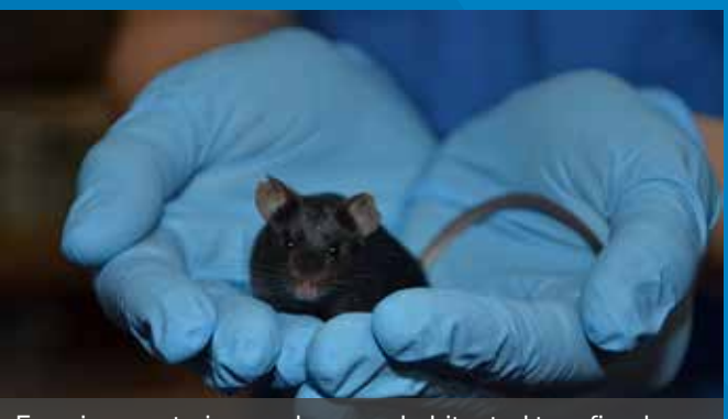
Even jumpy strains can become habituated to refined mouse handling methods.

Read more about the great work being done by staff at the MSRU at www.nc3rs.org.uk/MSRUrefinement.