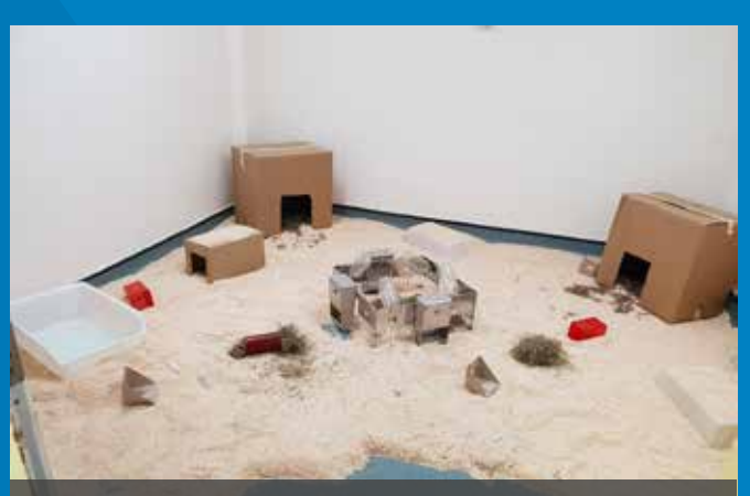
Repurposing a vacant room to create a floor pen for guinea pigs containing extra enrichment.