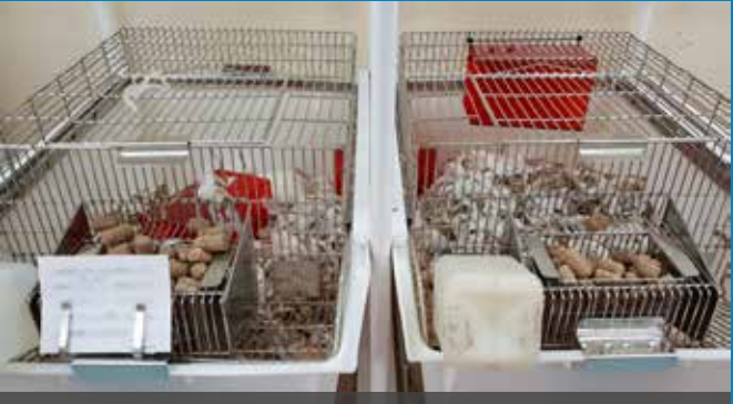
Refining rat housing by connecting two cages with a standard red tube.