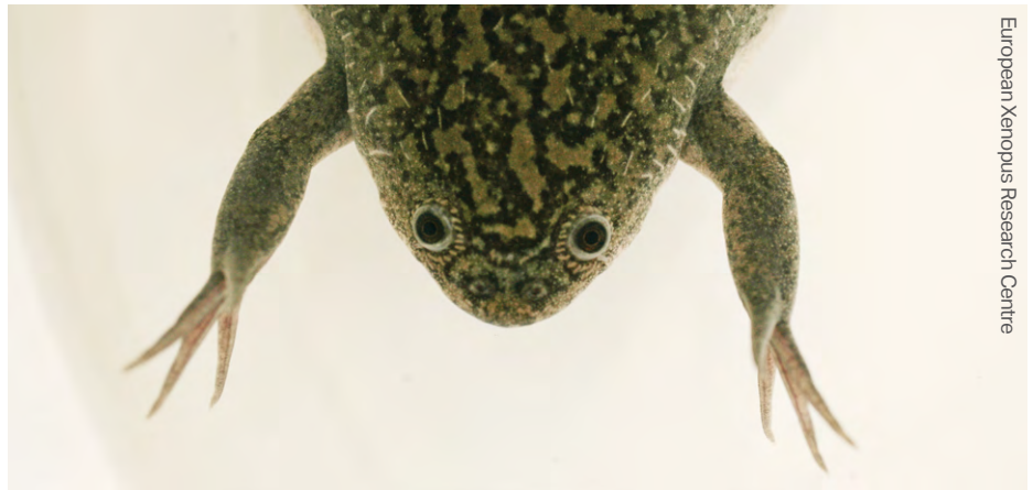
European Xenopus Research Centre

Subscribe online at www.nc3rs.org.uk/tech3rs to receive free hard copies of the newsletter (UK institutes only).